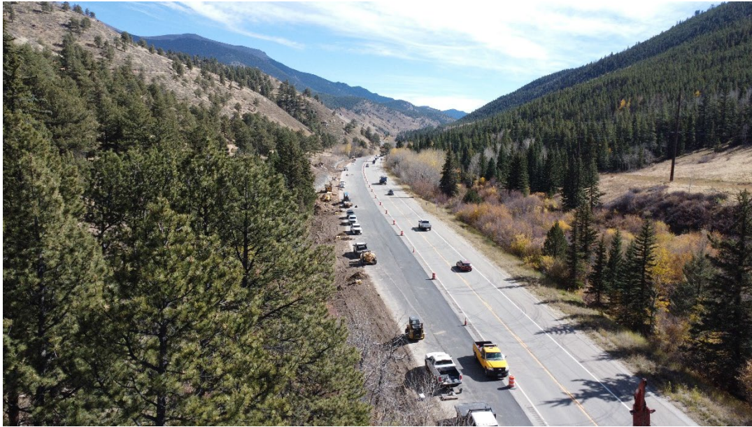
Asphalt installed on the west side of CO 285 near Grant